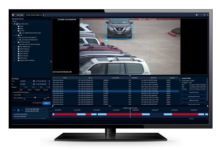
License Plate Recognition

Using an existing database, an automatic license plate reader recognizes a banned individual's vehicle entering the stadium parking lot and alerts stadium operations.